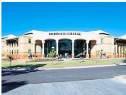
Murdoch College rep to meet potential students today