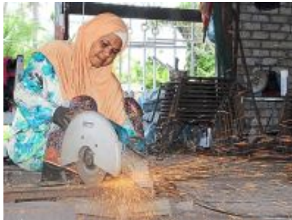
Planning for our country's future