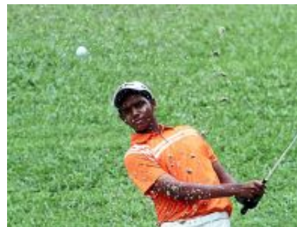
13-year-old storms to the fore