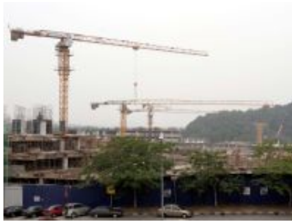
Budget 2015: New PR1MA scheme likely to be introduced