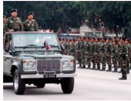
Budget 2015: Hoping for funds to beef up security in Sabah