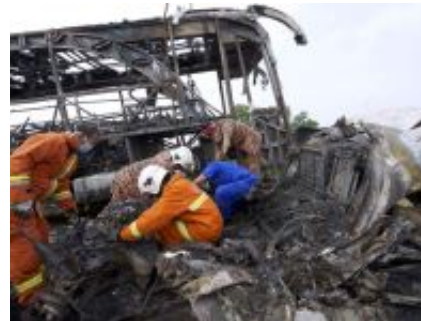
Couple burnt to death after car crashes into bus