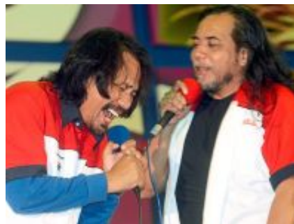
Valuable lessons in the music world, as told by Papa Rock