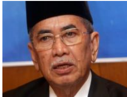
Cops to take swift action following Bukit Bintang blast,